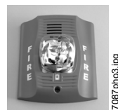
Indoor Wall Horn/Strobe