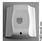
Indoor Wall Horn