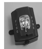
Outdoor Wall Strobe