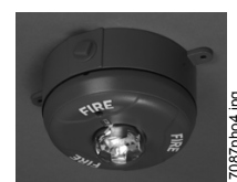
Outdoor Ceiling Strobe