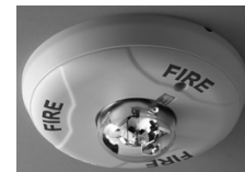
Indoor Ceiling Strobe