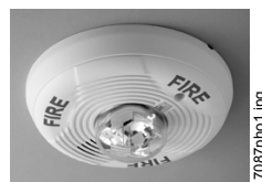
Indoor Ceiling Horn/Strobe